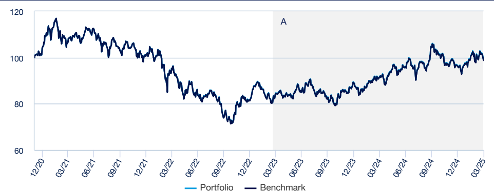
A: "Until March 24, 2023, the Fund's performance recorded corresponds to the performance of Lyxor MSCI Emerging Markets (LUX) UCITS ETF. This fund was absorbed by the Fund on March 24, 2023.